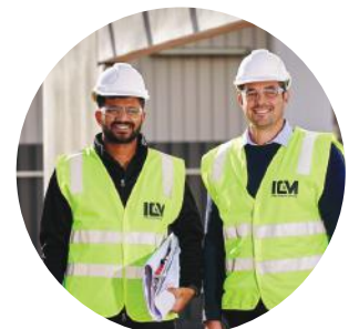
Plus Office Administrators, Site Managers & Project Administrators